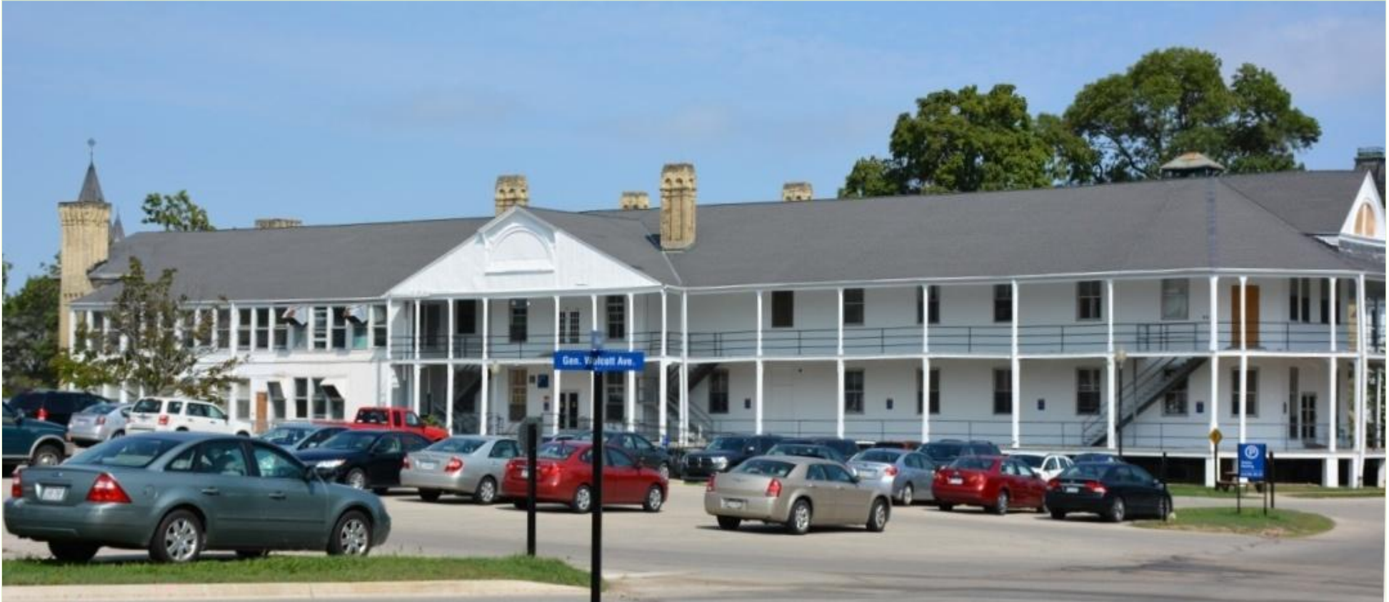
OLD HOSPITAL TB WING (after)