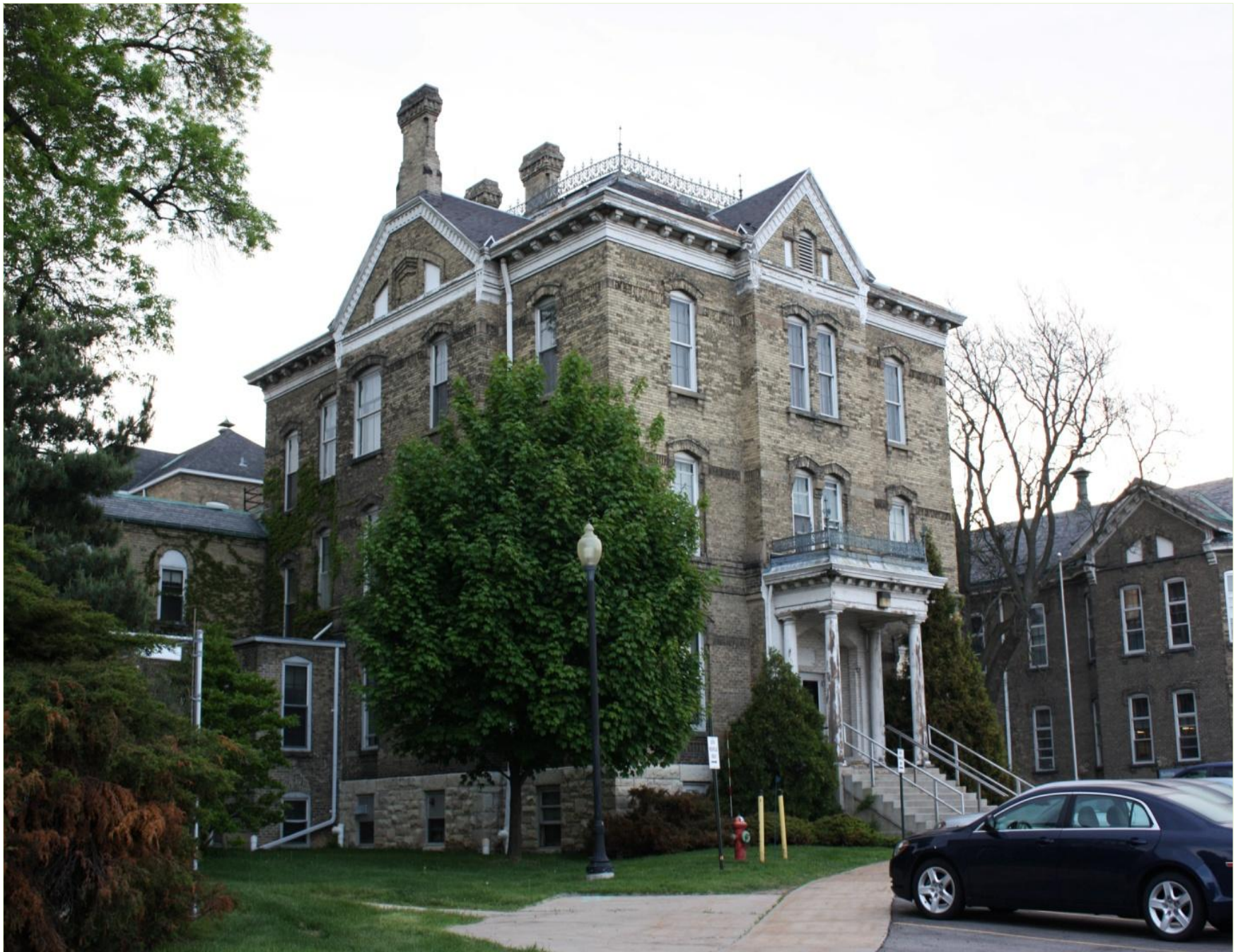
OLD HOSPITAL (before)