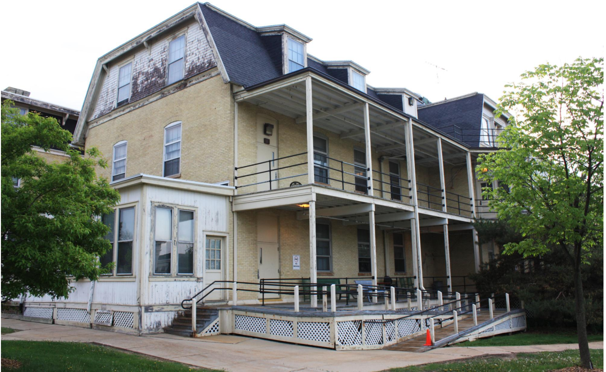
BARRACKS – BLDG 5 (before)