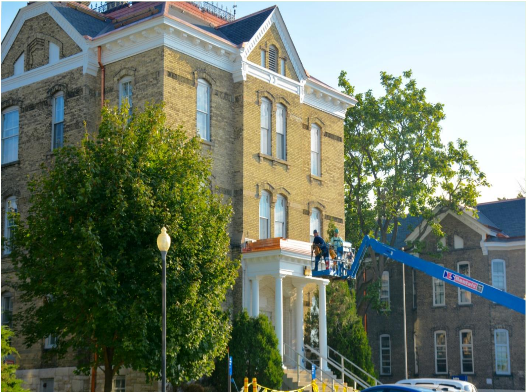
OLD HOSPITAL (after)