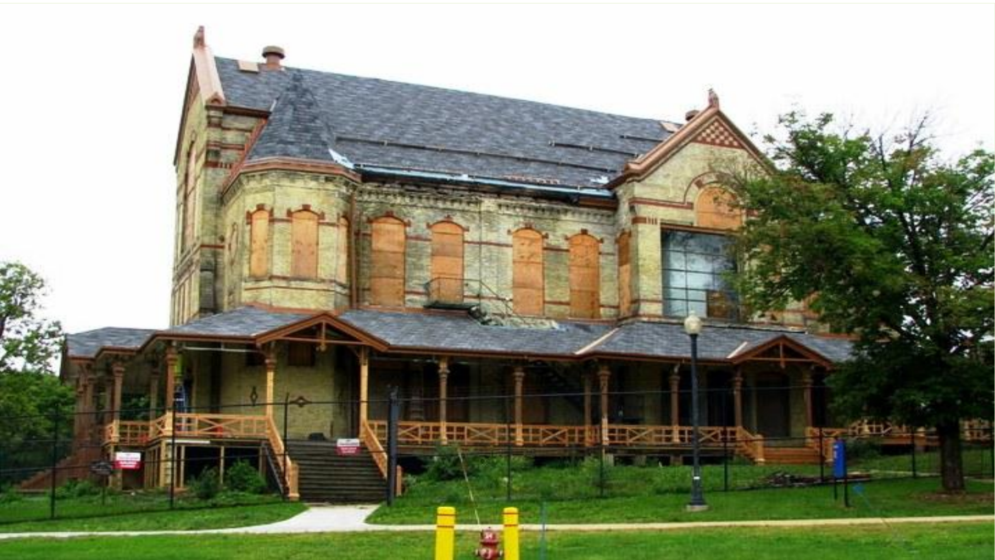
WARD THEATER (in process)