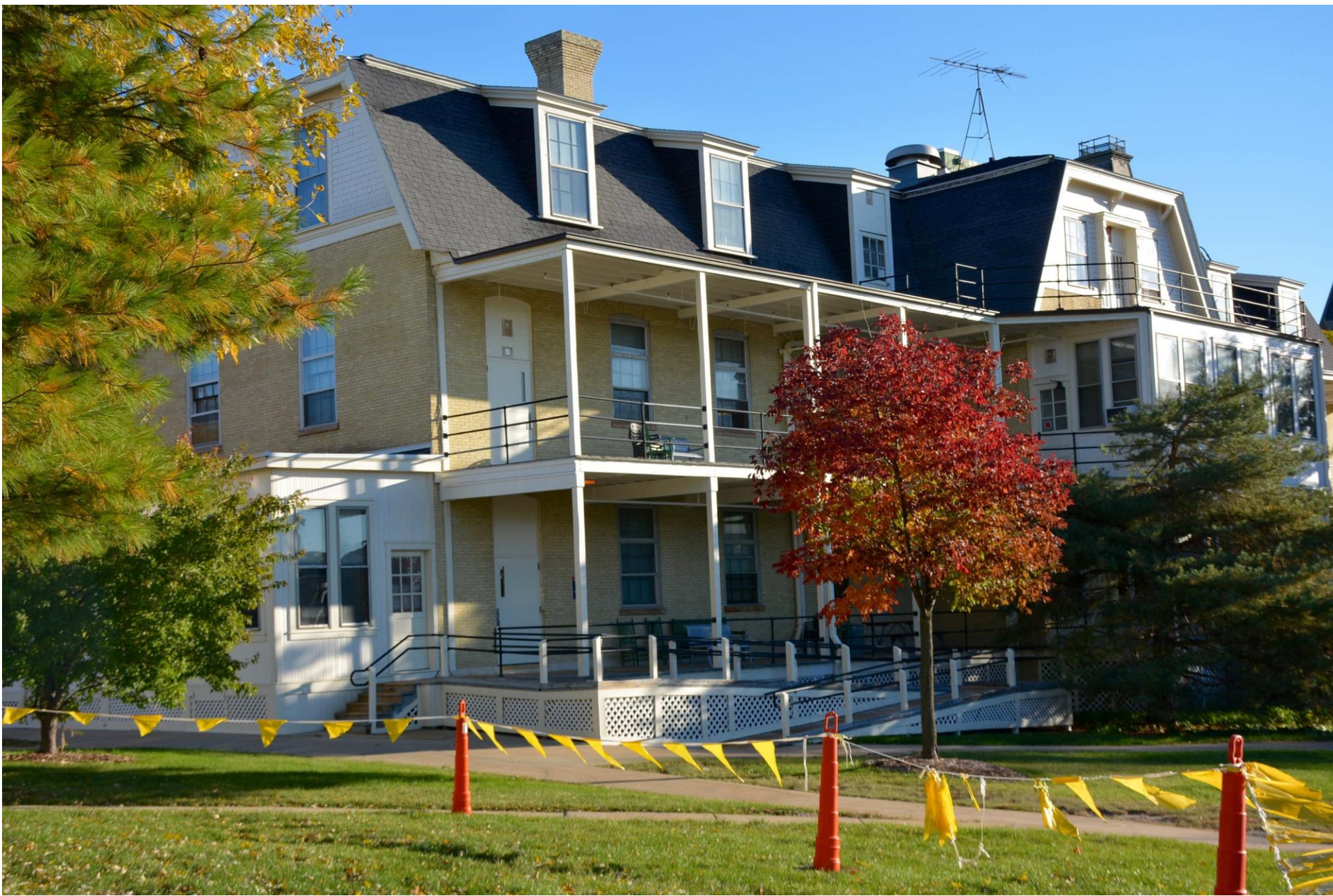
BARRACKS – BLDG 5 (after)