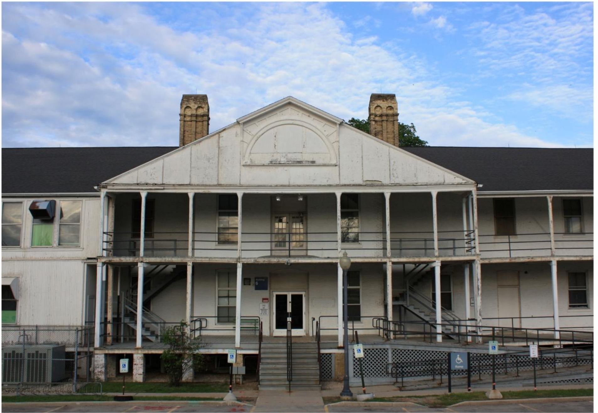
OLD HOSPITAL TB WING (before)